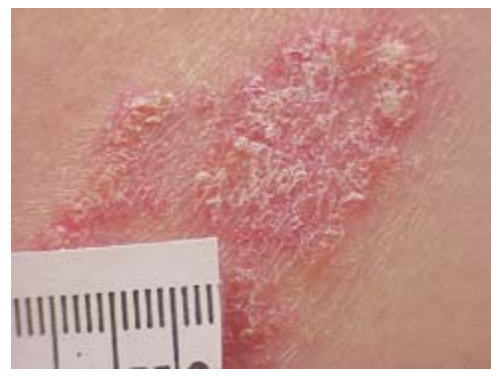
Figure 2. Classic silvery scale of a psoriasis plaque.