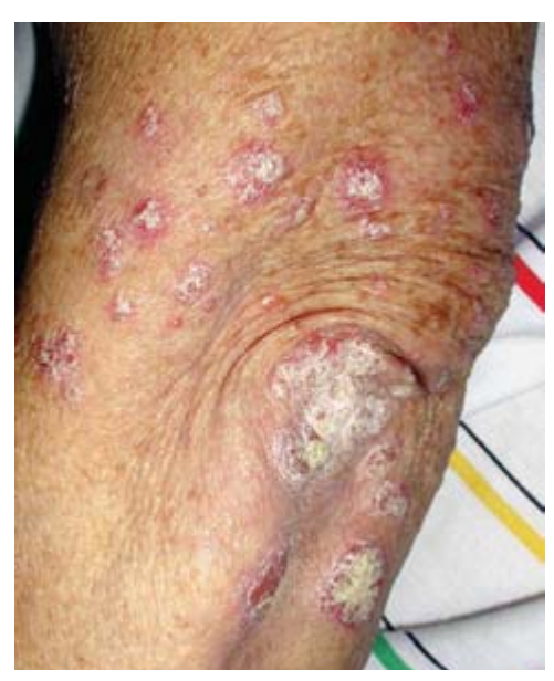
Figure 3. Psoriasis plaques on elbow.