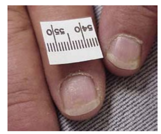
Figure 6. Nail pitting in a patient with psoriasis.