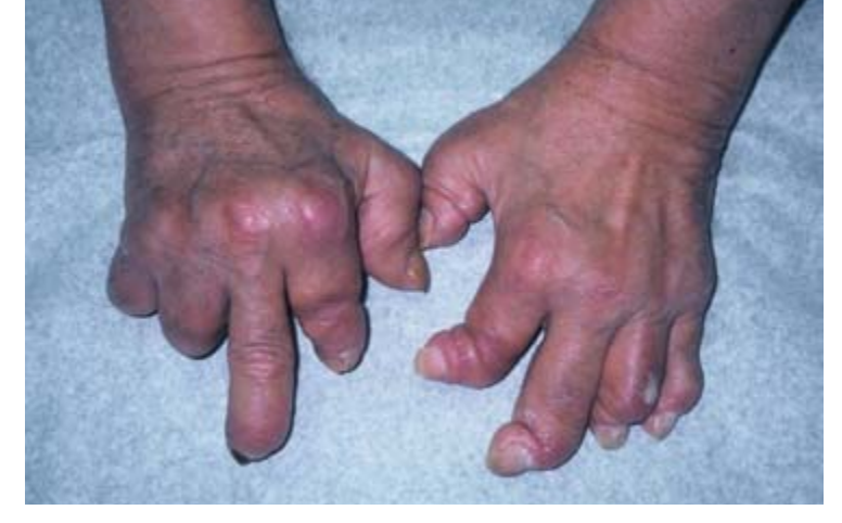
Figure 8. Severe psoriatic arthritis affecting the fingers.

Although a variety of nondrug therapies such as acupuncture, psychotherapy, and dietary supplements have been suggested for the management of psoriasis, there is insufficient evidence to support their use.