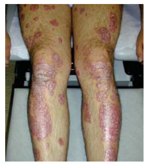
Figure 1. Symmetric and bilateral psoriasis plaques.

Inverse psoriasis, or flexural psoriasis