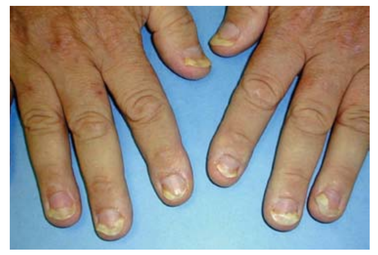
Figure 5. Onycholysis in a patient with psoriasis.